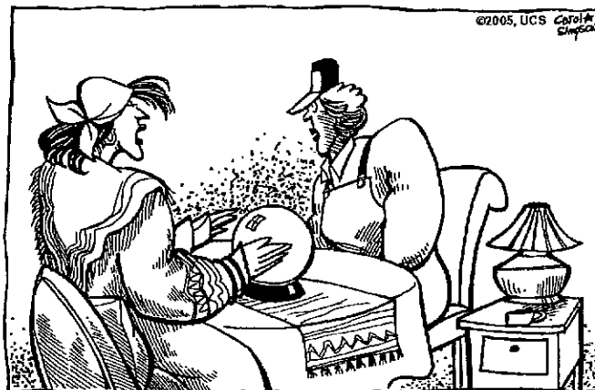
"I see pay equity in your future... but only if you organize a union."

The Officers believe this website will be a good tool moving forward. If you have any suggestions to better improve the website, go to "Contact Us" and relay your suggestions. Visit the site often and keep yourself informed. www.ibew459.org